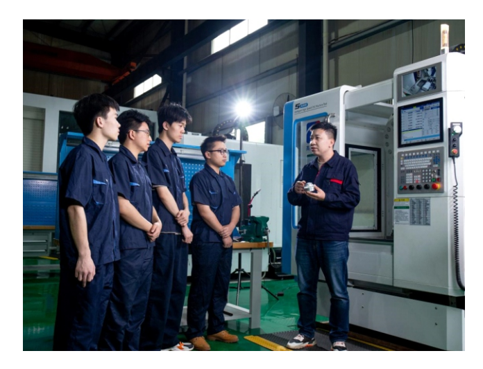
Mechanical Training Center