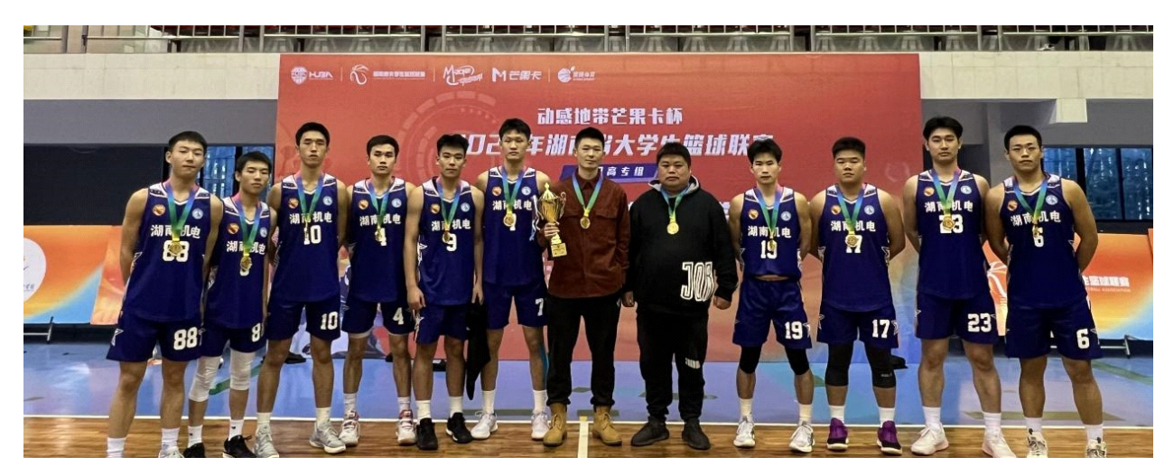
CUBA Division III Champion