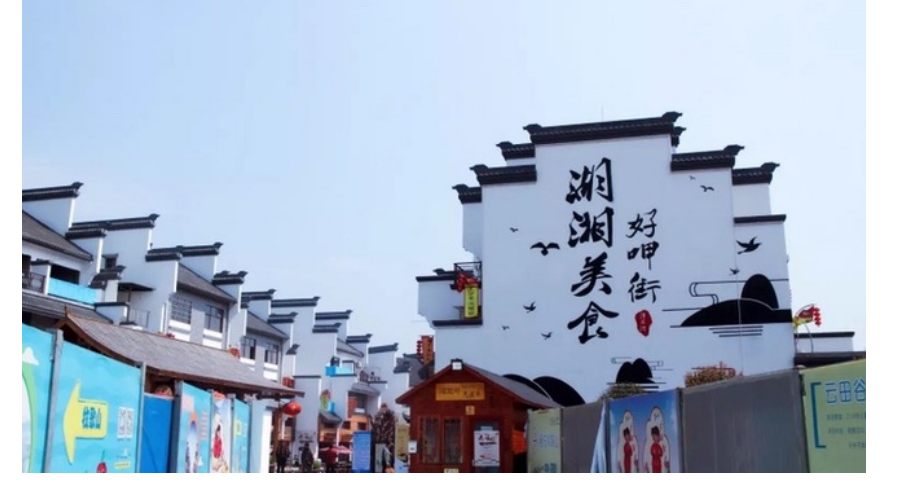
Xun Longhe Ecological art Town