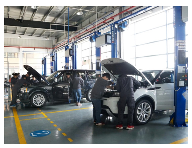
Automotive Training Center