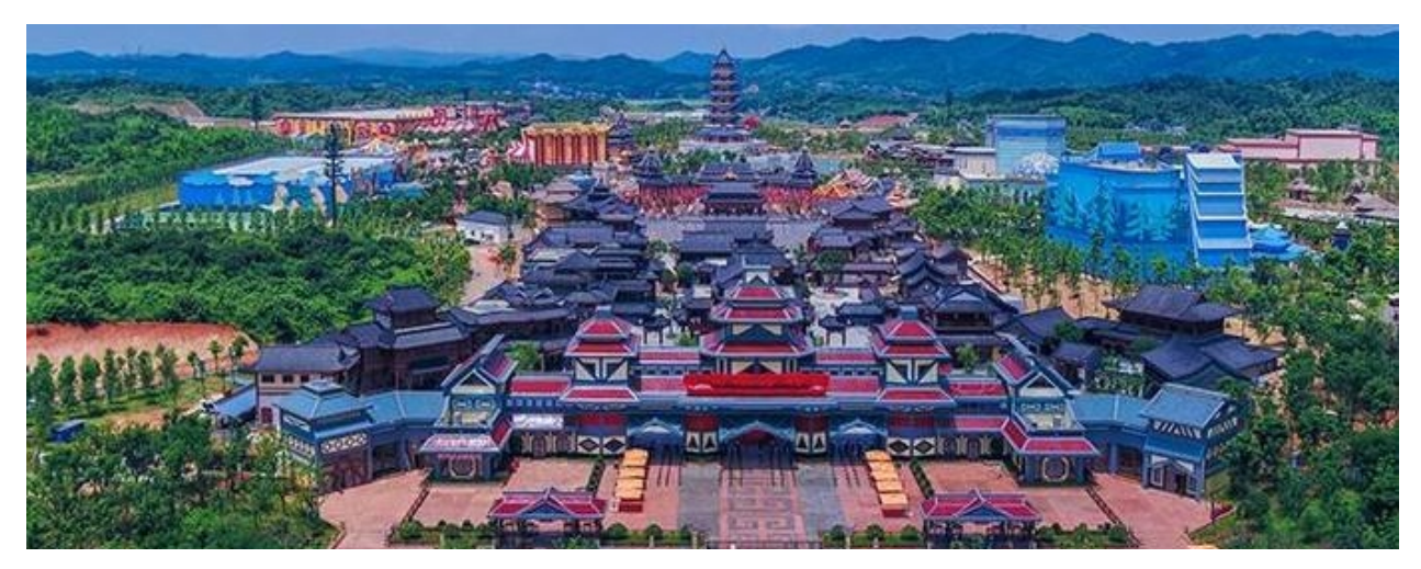
Changsha Fantawild Oriental Heritage Theme Park