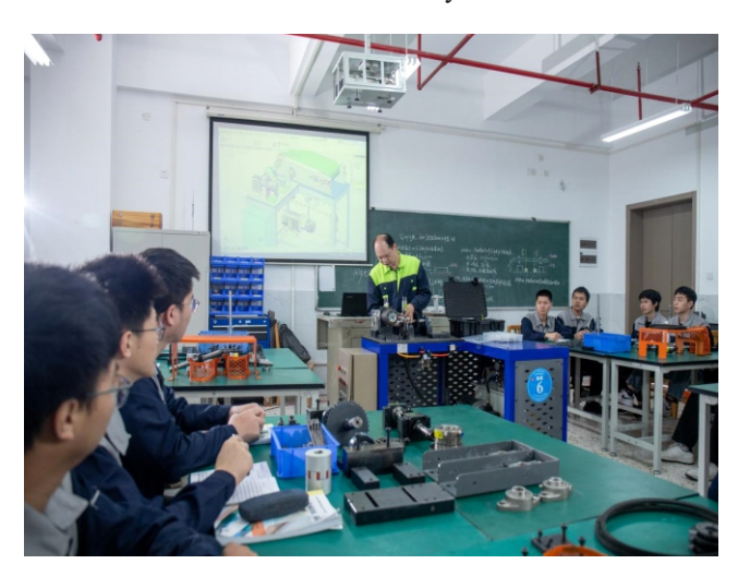
Theory-Practice Integrated Classroom

Campus life is colorful. We are always open for creative ideas and support students' initiative and participation in academic lectures and competitions. We provide various clubs and organizations covering culture, art, sports, and other aspects, allowing students to develop their interests in their spare time. In addition, we regularly hold various cultural festivals and social activities to promote students' personal growth.