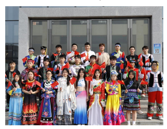
Students from Different Ethnic Groups